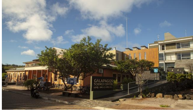
2 - Galápagos Science Center