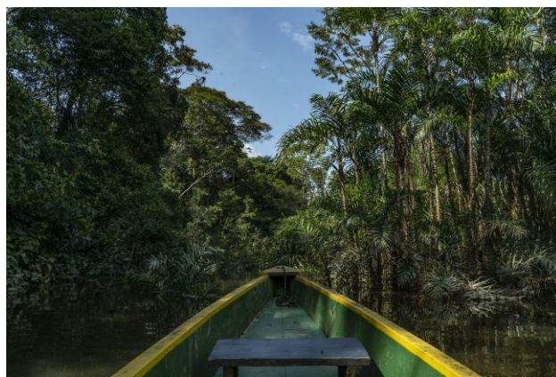
1 - Tiputini Biodiversity Station

USFQ also runs a research station in the Amazon basin called Tiputini Biodiversity Station (TBS). The station is located on the border of Yasuní National Park, one of the world's most fantastic biodiversity hotspots and one of the planet's last wilderness areas.